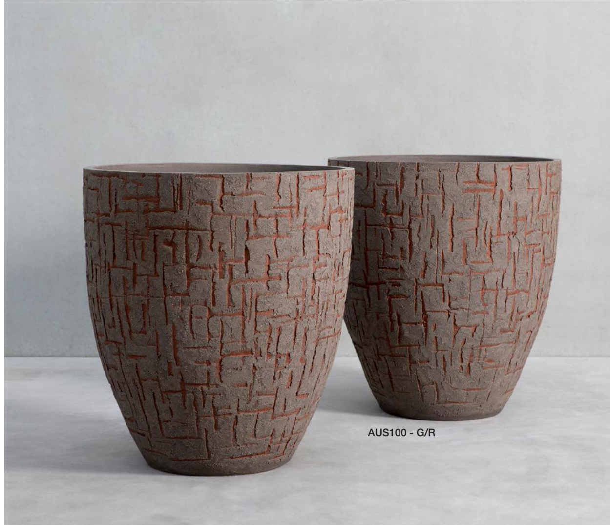
AUS100 - G/R