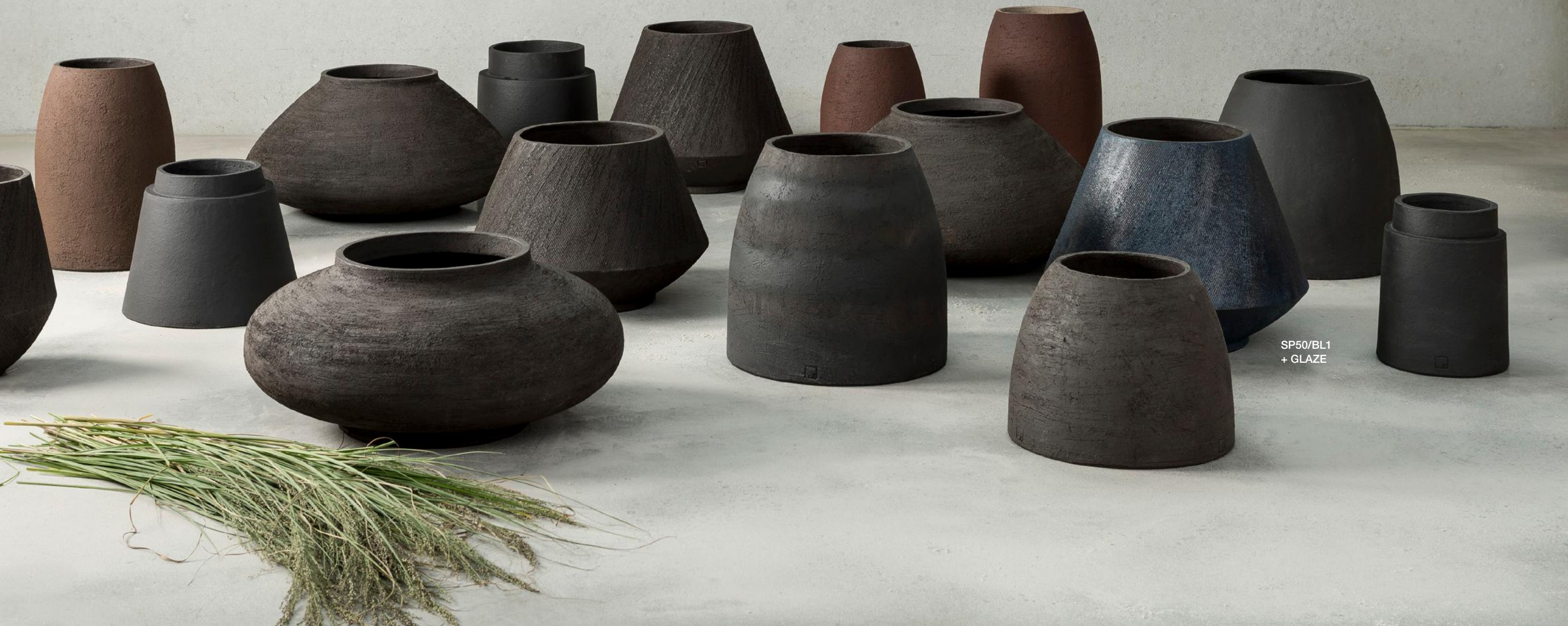
SP50/BL1 + GLAZE

The launch of the SP vase — that comes with a two-directional texture and an emerald green or admiral blue colour finish. Originally designed as a flowerpot, they can be used without plantation, as iconic object, or filled up with dry leaves or branches.